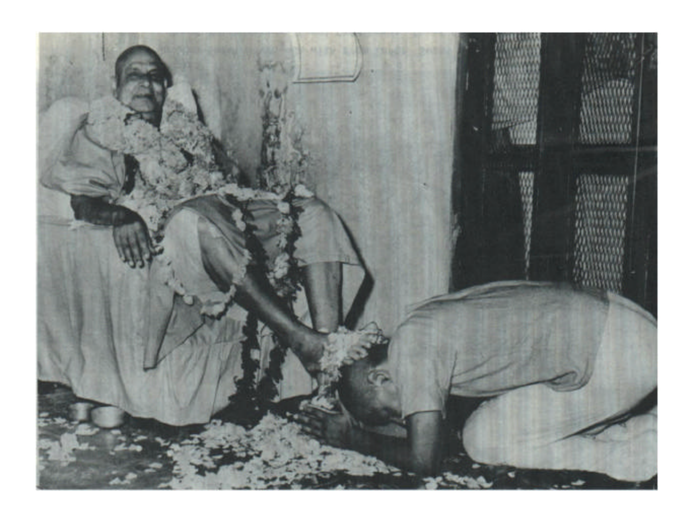
Gurudev Sivananda and Siva-Pada-Renu, Swami Venkatesananda (The title "Siva-Pada-Renu" means "the Dust of Gurudev Sivananda's Feet".)